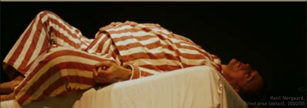
Ketil Nergaard, Tilted Arse (detail), 2000/05