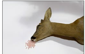
Børre Sæthre, Powered by ZERO (the end of the BAMBI cycle) , 2005.

Børre Sæthre, Powered by ZERO (the end of the BAMBI cycle) , Galerie Loevenbruck , Paris. 12 Nov 05–14 Jan 06