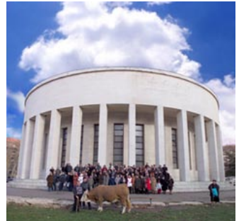
Kristina Leko, Cheese and Cream , ongoing project since 2002.

Working with video, photography, text, and social interaction, Kristina Leko's work includes the collecting of found objects, interaction with the public sphere, and communication/documentary projects in collaboration with various social groups. Projects include Sarajevo International , a video-communication project in collaboration with 12 immigrants from Sarajevo (2001); On Milk and People , an exhibition in collaboration with Croatian and Hungarian farmers (2002/03); Cheese and Cream , various actions and artifacts dedicated to protection of the milkmaids of Zagreb (2002–); and Verfassungs-korrekturbuerro , an action in progress improving the USA Constitution (2004–).