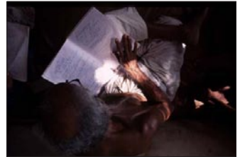
Amar Kanwar, still from A Night of Prophecy , 2002.

Amar Kanwar (b. 1964, India) was the first winner of the Edvard Munch Award for Contemporary Art in 2005. The National Museum shows a trilogy of Kanwar's films that together provide a personal and spiritual insight to issues of violence, political conflict and a desire for peaceful resolution. Screenings of: A Season Outside , 1998; A Night Of Prophecy , 2002; To Remember , 2003.